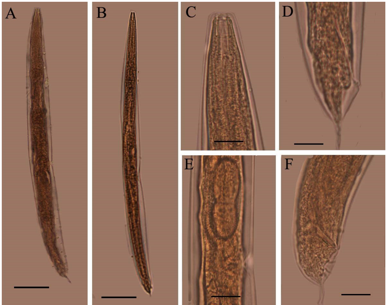
Supplementary Fig. S2. Light photomicrograph of Poikilolaimus oxycercus de Man, 1895 (A-F): Female (A, C-D): A, whole body; C, pharyngeal region; D, tail region; E, vulval region; Male: B, whole body; F, ventral view of tail region showing papillae (scale: A, B =10 \mu m; C-F=50 \mu m).